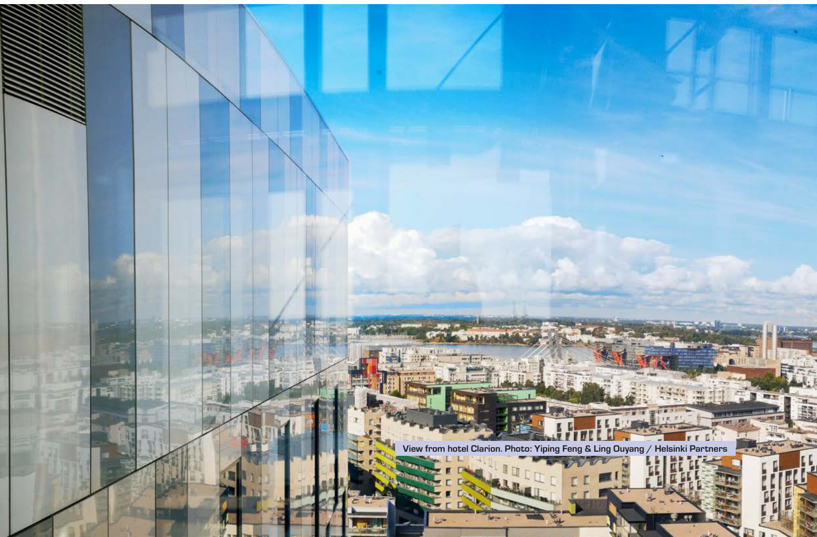
View from hotel Clarion.

Free Wi-Fi internet connection is available in the Congress Centre.