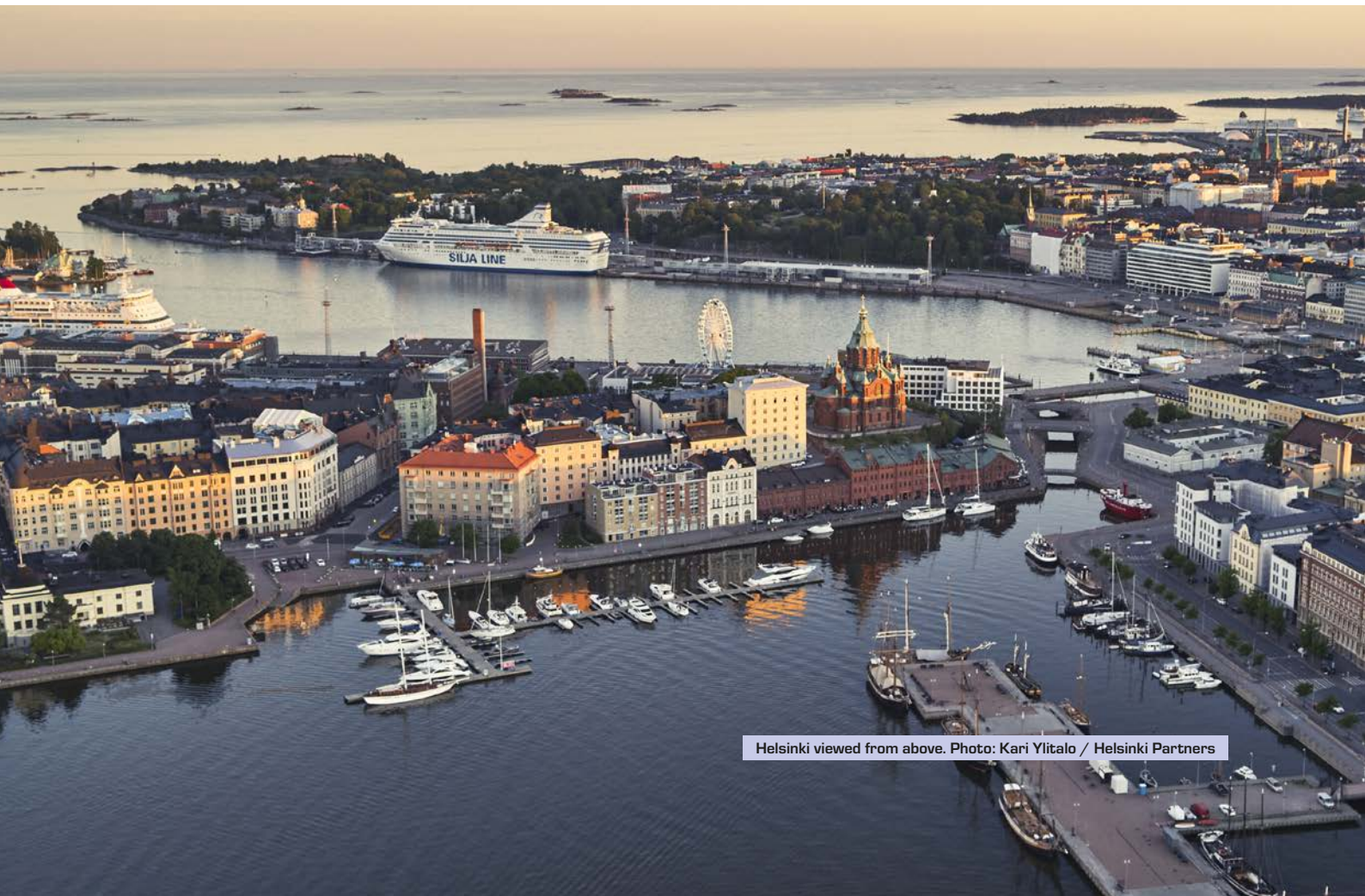
Helsinki viewed from above.